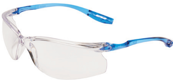
71511-00000 Lens: Clear