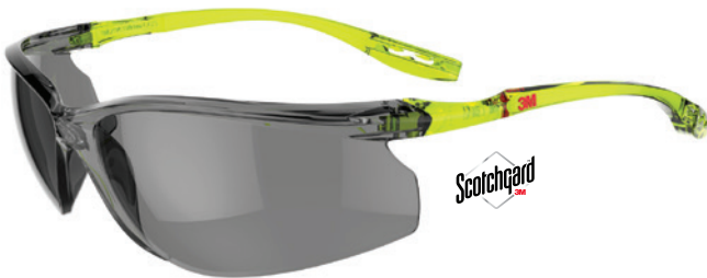
SCCS02SGAF-GRN Lens: Grey