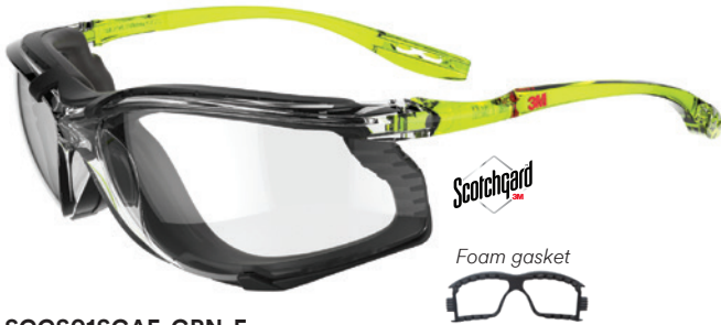
SCCS01SGAF-GRN-F Lens: Clear