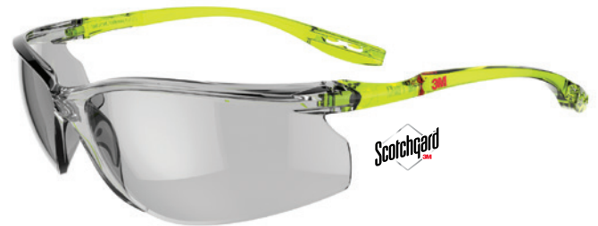
SCCS07SGAF-GRN Lens: I/O Grey