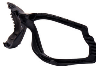
71511-99999 Foam insert