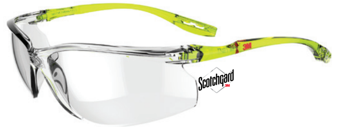
SCCS01SGAF-GRN Lens: Clear