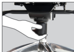
Weight Tension Control