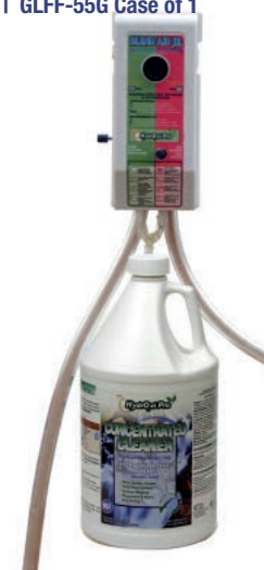
Blend Aid Jr. (BA-JR)

Scan me to learn more about our Green Products on our website, or visit us at coreproductsco.com to learn more.