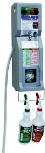
Blend Aid II (BA-2)

Product Codes: GLFF-128 Case of 4 | GLFF-5G Case of 1 | GLFF-55G Case of 1