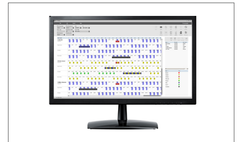
TimeMoto PC Software Plus Art.no: 139-0602