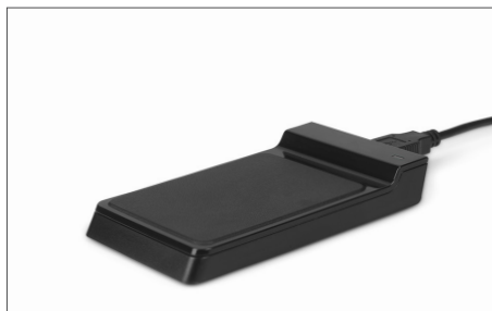
TimeMoto RF-150 USB RFID Reader Art. no: 125-0605