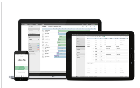
TimeMoto Cloud / TimeMoto Cloud Plus Art.no: 139-0612 / 139-0613