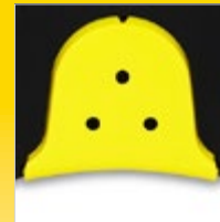
INTEGRATED FLUSH BRACKET