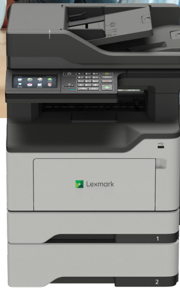
MB2442adwe with optional tray