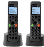
Twin Pack DOT212