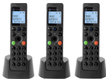
Triple Pack DOT213