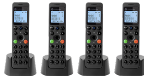
Quad Pack DOT214