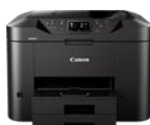
MAXIFY MB2750 series