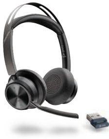
VOYAGER FOCUS 2 UC