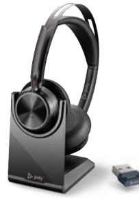
VOYAGER FOCUS 2 UC WITH CHARGE STAND