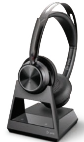
VOYAGER FOCUS 2 OFFICE