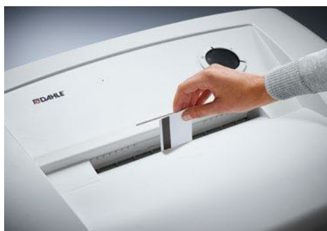
Dahle Office 414 document shredder