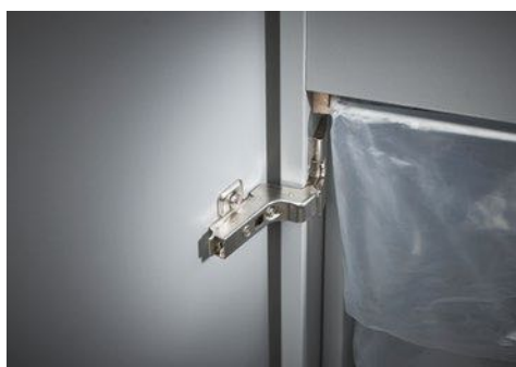
Dahle Office 414 document shredder