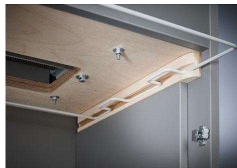
Dahle Office 414 document shredder