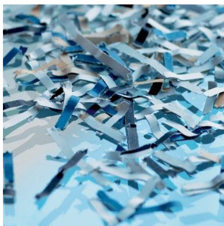
P-4 security: recommended, for example, for data media containing particularly sensitive, confidential and personal data