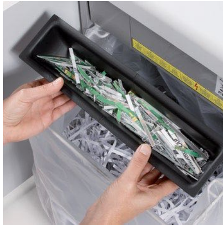
Separate, integrated waste boxes help to sort shredded paper, CDs, DVDs, cheque and credit cards for eco-friendly recycling