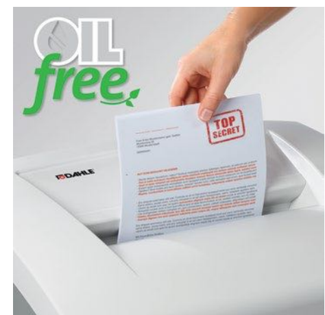
Shredding the convenient way, all without the time-consuming process of oiling the cutters