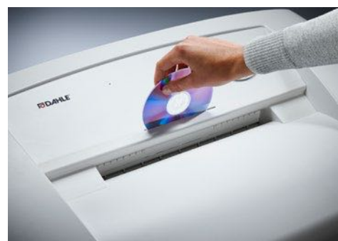
Dahle Office 414 document shredder