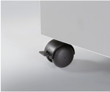
Practical swivel casters for flexible use