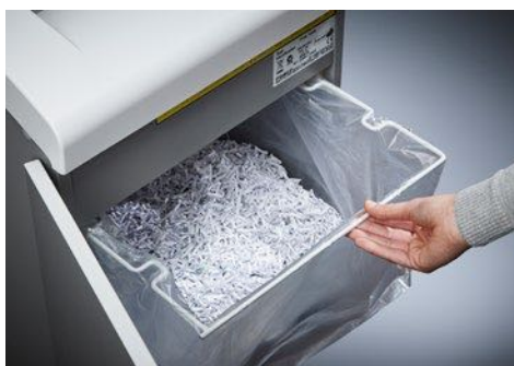
Dahle Office 414 document shredder