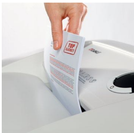
Innovative MHP technology® shreds up to 30 % more paper