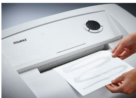
Dahle Office 414 document shredder