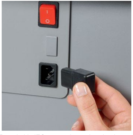
Detachable IEC power plug makes the document shredder quick and easy to move from A to B