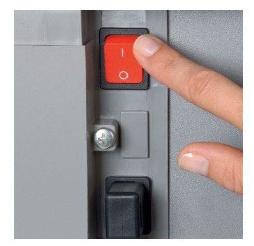
Separate main switch is located on the rear of the document shredder and completely disconnects it from the mains power supply