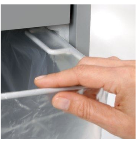
Pull-out rounded top frame that's kind on the fingers when changing the waste bag