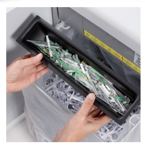
Separate, integrated waste boxes help to sort shredded paper, CDs, DVDs, cheque and credit cards for eco-friendly recycling