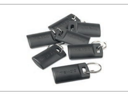
TimeMoto RF-110 set of 25 RFID key fobs Art.no: 125-0604