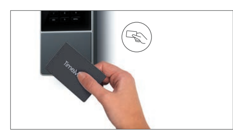
Clocking with RFID proximity card or PIN code

* After the 30-day trial, choose your subscription: TimeMoto Cloud or TimeMoto Cloud Plus