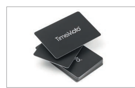
TimeMoto RF-100 set of 25 RFID badges Art. no: 125-0603