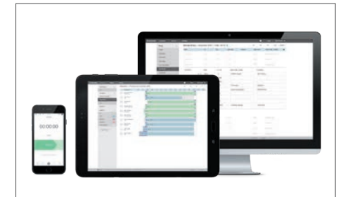
TimeMoto Cloud / TimeMoto Cloud Plus Art.no: 139-0590 / 139-0591