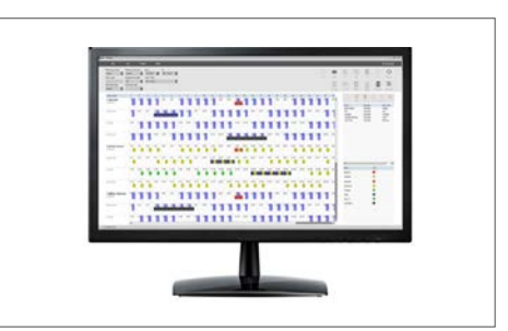
TimeMoto PC Software Plus Art.no: 139-0600