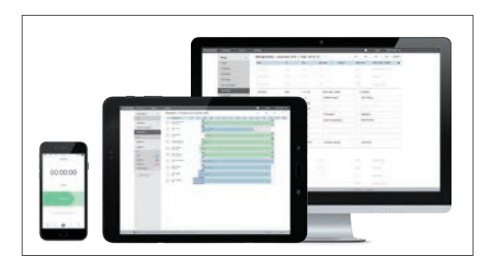
Or TimeMoto Cloud (30 days included)