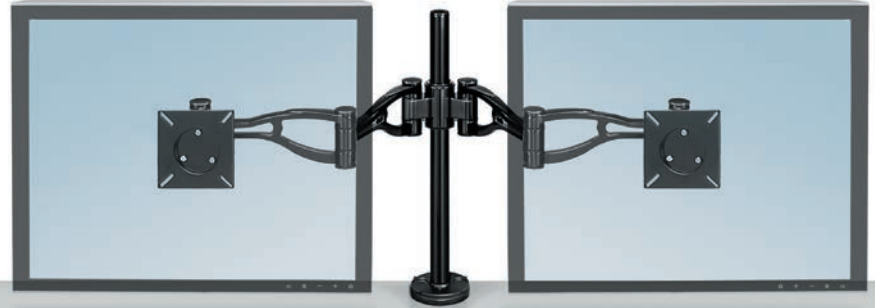
8041701 Professional Series Depth Adjustable Dual Monitor Arm