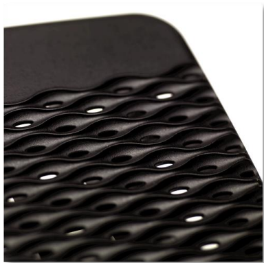
Vented platform Allows air to circulated around your feet