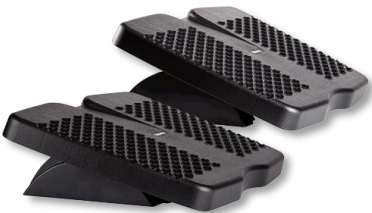
Height adjustable Dual position height settings for comfortable working