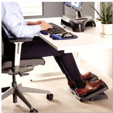
Ergonomic positioning Elevates feet and legs to help relieve lower back pressure and improve posture