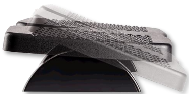
Sliding platform Sliding platform offers angle adjustability for optimal comfort