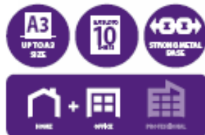
Edge-320 A4 Trimmer