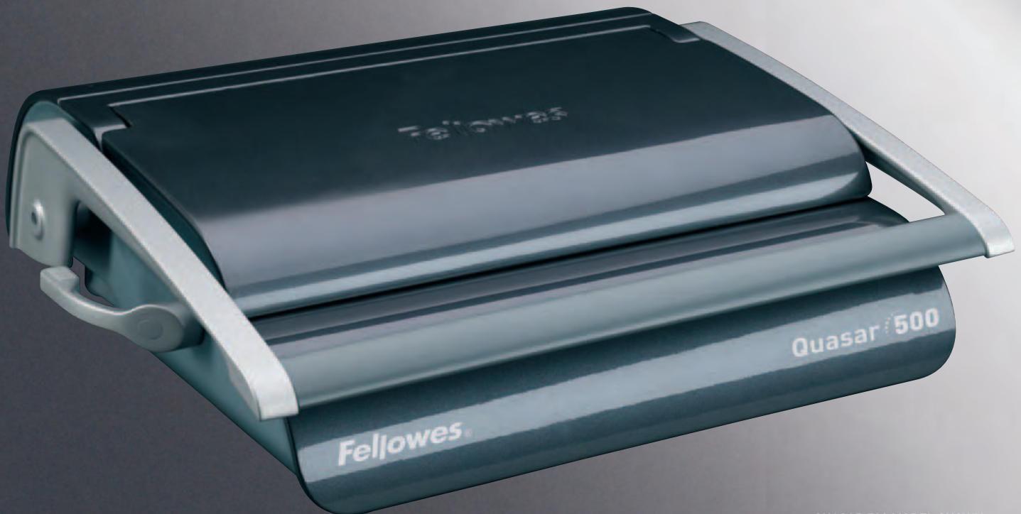
QUASAR 500 MODEL SHOWN