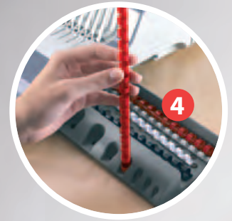
QUASAR-E 500 MODEL SHOWN