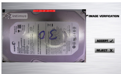
Accept or reject image