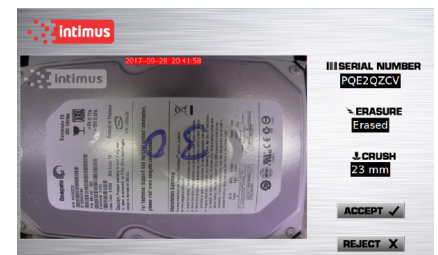
Proof of Erasure image