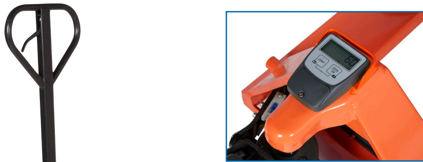
WPT57H Weigh Scale Display