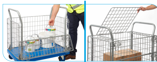
Hinged Lid Top on the PPU24Y & 1/2 Drop Side on the PPU23Y & PPU24Y