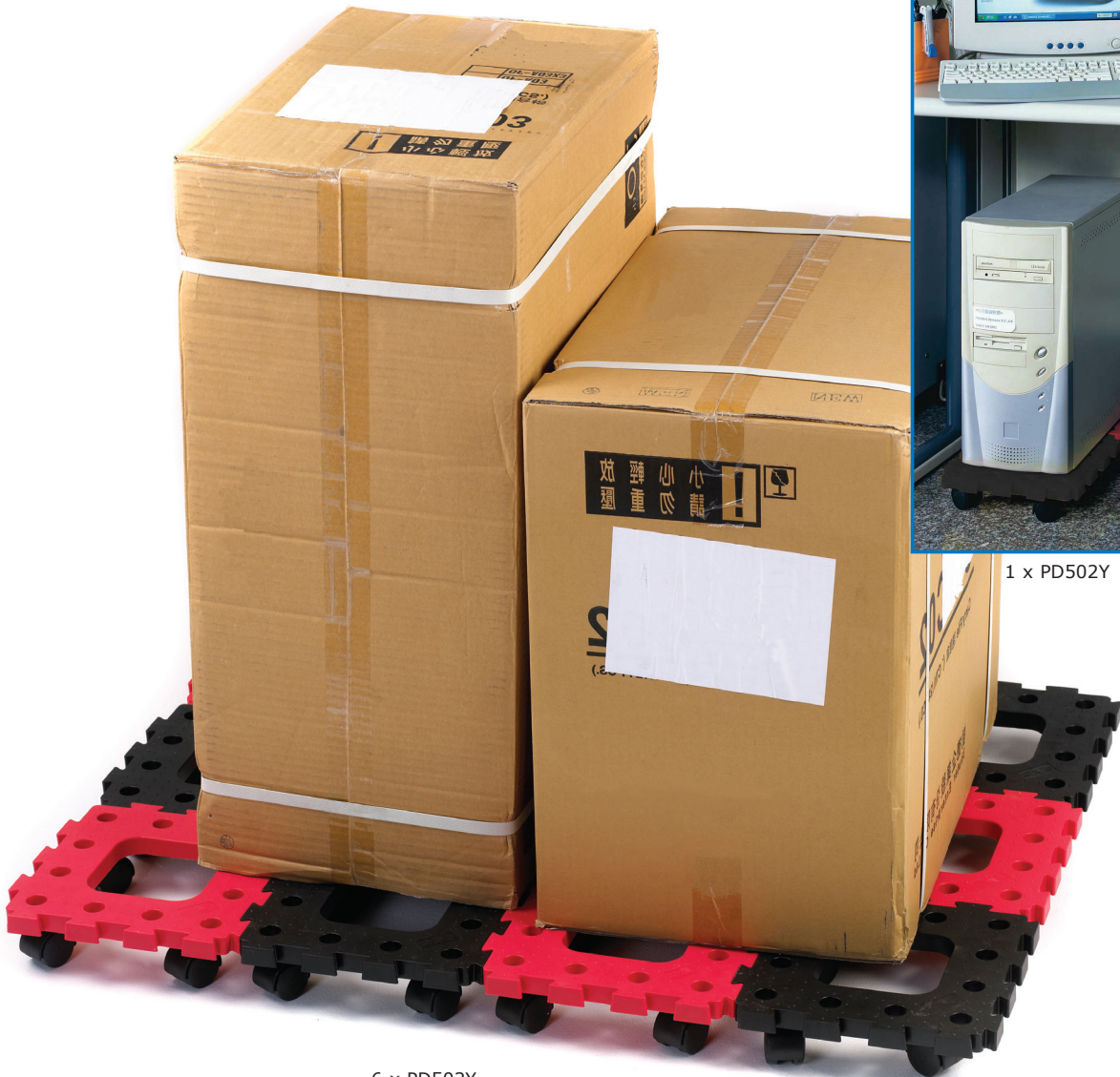
1 x PD502Y

Scan the QR code above with your smartphone or tablet device to watch the product video.