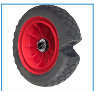
PUNCTURE PROOF & REACH COMPLIANT WHEELS