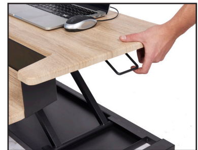
Height can be adjusted to any position

Simply place on a surface & enjoy the flexibility of standing or sitting at your desk A pneumatic air cylinder allows smooth adjustments from sit to stand in seconds, bringing the maximum height of 620mm above the desktop