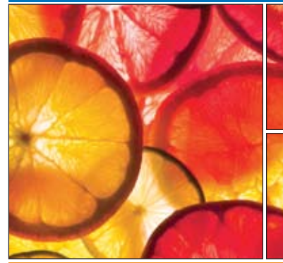
Xtreme Citrus (67-6115TM) oranges and various tropical citrus notes, Xtreme Citrus delivers maximum fragrancing that can only be described as extreme.

Developed from a unique blend of essential oils and natural extracts for the sole purpose of eliminating odors, Natural effectively removes odors without masking them, creating a fresh, scentless area. Natural is non-toxic and non-hazardous.