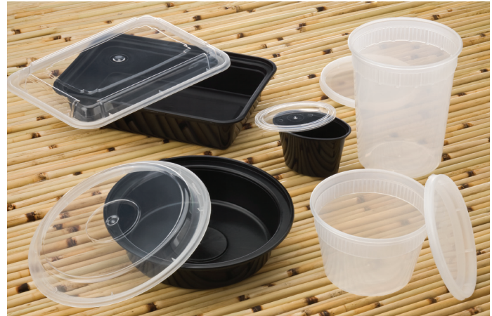
Available in a full range of sizes with black and white bases

DELtainer® containers are perfect for any Asian style soups. We offer a variety of sizes including 16 and 32 oz. clear designs that are perfect for your carry-out customers. Like all Newspring containers, these are microwaveable, stackable, end-user reusable and refrigerator-friendly.