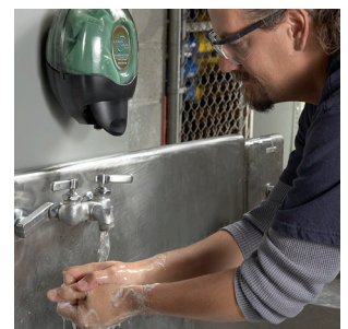
In the plant...