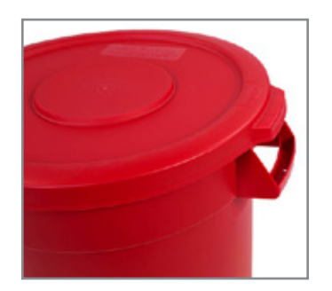
Stay On Lids Snap down and presspull lids stay on and remove with ease