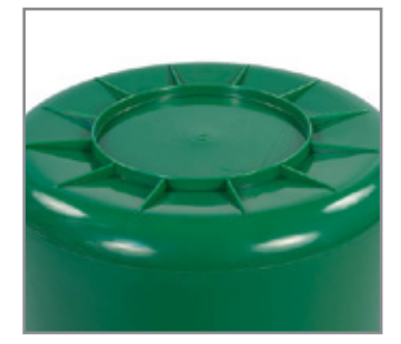
Reinforced Drag Skids Prolong life of the can