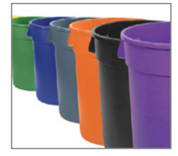
9 Colors & Food Safe Store and segregate large amounts of food products