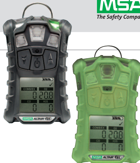
ALTAIR 4X Multigas Detector – charcoal (left) and phosphorescent (right)

ALTAIR 4X Detector with North American approval, quick-start card, data logging, charger, calibration cap and tubing, CD manual. MotionAlert™ feature is now standard on all detectors.