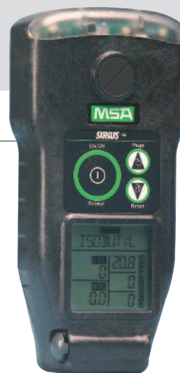
Sirius Multiqas Detector

Sirius Multigas Detectors provide outstanding alarms to clearly warn users of potentially hazardous situations. Interchangeable lithium-ion and alkaline battery packs keep instruments running 24/7.