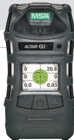
ALTAIR 5X Multigas Detector

MSA's ALTAIR 5X Multigas Detectors are available with high-resolution color or monochrome LCD display with multilingual capabilities; MSA's Logo Express® Service can customize your color display. Easily configurable detectors with interchangeable plug-and-play MSA XCell Sensor slots can monitor up to six gases simultaneously. Optional glow-in-the-dark instrument housing is available for IR sensor-equipped units. Lithium-ion battery lasts for 20 hours for multiple shift use; alkaline battery pack is also available. ALTAIR 5X Multigas Detector is fully compatible with the MSA GALAXY® GX2 Automated Test System and MSA Link Software.