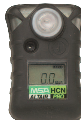
ALTAIR PRO HCN Fire Single-Gas Detector