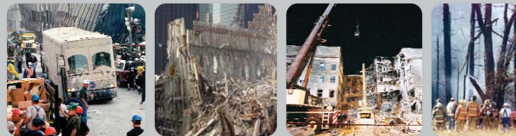
September 11, 2001 changed the face of homeland security

With nearly a century of history and success behind it, MSA today again stands ready to protect Americans – this time against potential airborne contaminants that could be unleashed by terrorists across our homeland.