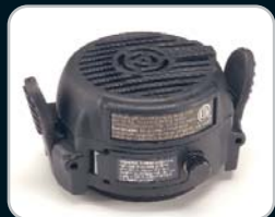
ESPII® Communications system