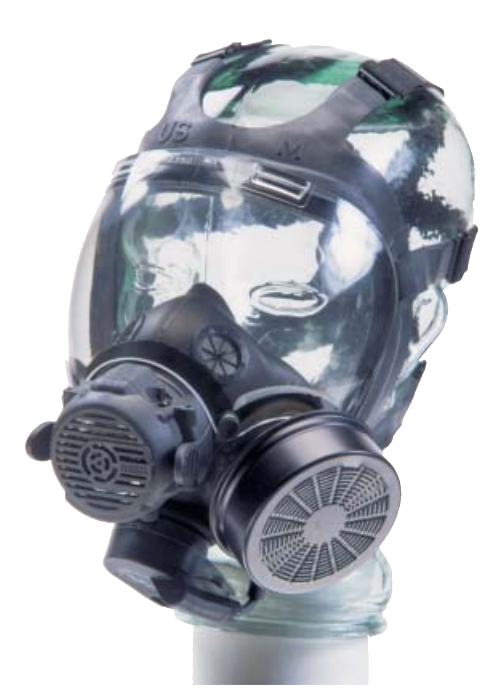
The Millennium<sup>®</sup> Chemical-Biological Mask with the ESP<sup>®</sup> II Communication System