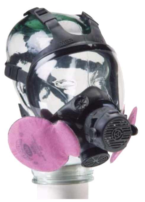
The Advantage<sup>®</sup> 1000 Respirator with the ESP<sup>®</sup> II Communication System