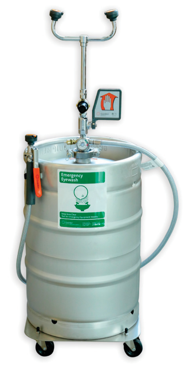
Note: Shown with optional G1562DLY dolly (sold separately).

G1562DLY Custom-sized stainless steel dolly for easy transport and storage. Includes (4) chemical resistant polyolefin wheels with lockable casters. Caster stems prevent unit from sliding off platform.