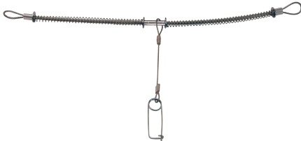
WB1C - WB1 with safety clip and lanyard