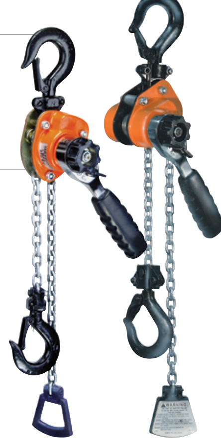
SERIES 602 SERIES 603