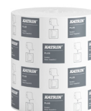
460058 Katrin Plus Dispenser Paper Towel Roll System Medium 2-Ply