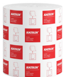
460201 Katrin Dispenser Paper Towel Roll System Medium 1-Ply