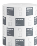
38015 Katrin Plus Dispenser Paper Towel Roll System M 3-Ply