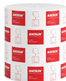
460102 Katrin Dispenser Paper Towel Roll System Medium 2-Ply