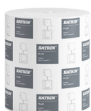
57795 Katrin Plus Dispenser Paper Towel Roll System Medium 2-Ply