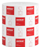
460232 Katrin Dispenser Paper Towel Roll System Large 2-Ply

Selection from all countries. Please refer to web page for market-specific availability.