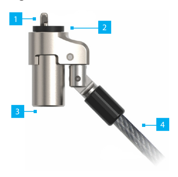
*Product may vary from image