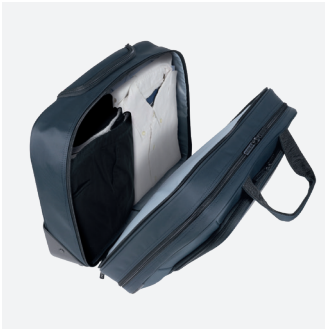
For personal items