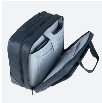
With reinforced laptop pocket and reinforced tablet pocket