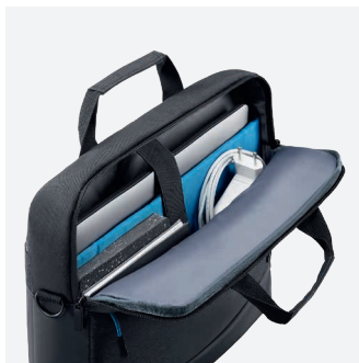
With reinforced laptop compartment