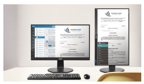
EasyRead mode for a paper-like reading experience