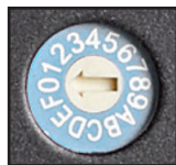
Rotary Dip Switch

The Rotary Dip Switch is located on the front of the Transmitter and Receiver .