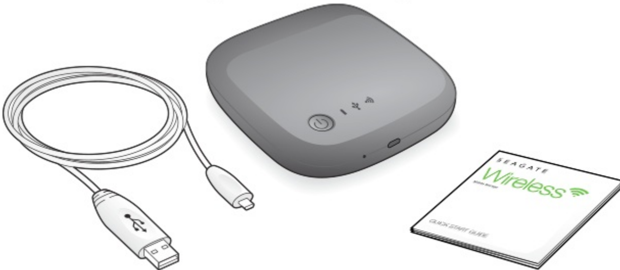
Detachable USB 2.0 Cable