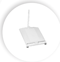
R-GO MORELIA DOCUMENT HOLDER