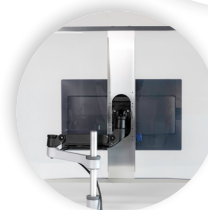
R-GO HYGIENIC SAFETY SCREEN