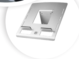
R-GO MORELIA LAPTOP HOLDER