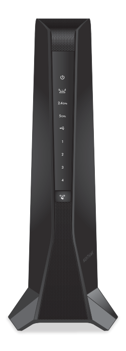
Figure 2. Front panel