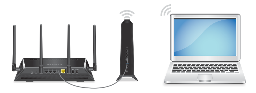
Figure 4. Extender in access point mode

You can use the extender as a WiFi access point, which creates a new WiFi hotspot by using a wired Ethernet connection.