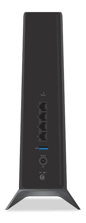
Figure 3. Back panel

The back panel of the extender provides ports, buttons, and a DC power connector.