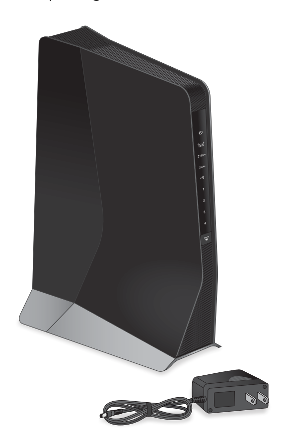
Figure 1. Extender package contents

Your package contains an extender and power adapter.