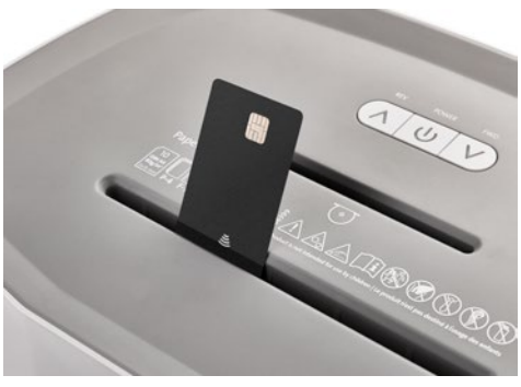
DAHLE PaperSAFE® document shredder 420 DAHLE PaperSAFE® document shredder 420