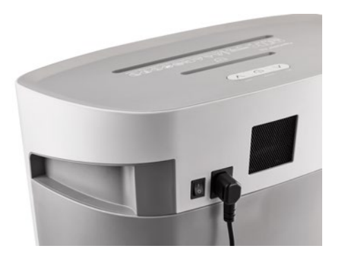
DAHLE PaperSAFE® document shredder 420 DAHLE PaperSAFE® document shredder 420 DAHLE PaperSAFE® document shredder 420