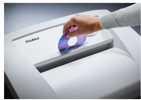
Dahle Office 410 L plus document shredder