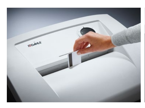
Dahle Office 410 L plus document shredder