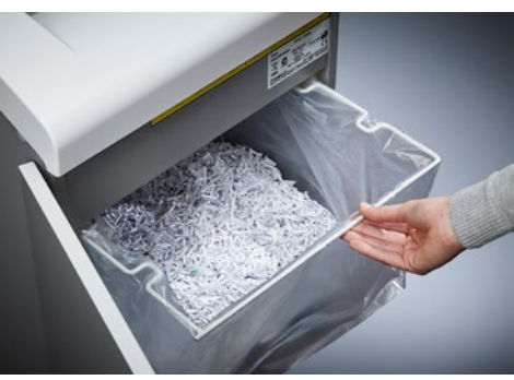
Dahle Office 410 L plus document shredder