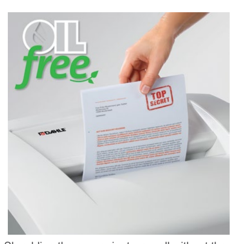
Shredding the convenient way, all without the time-consuming process of oiling the cutters