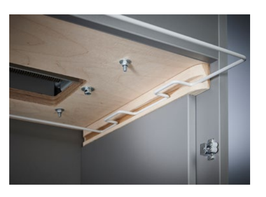
Dahle Office 410 L plus document shredder