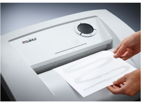
Dahle Office 410 L plus document shredder