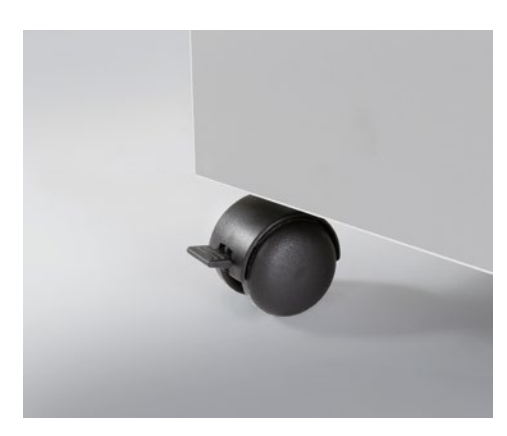
Practical swivel casters for flexible use