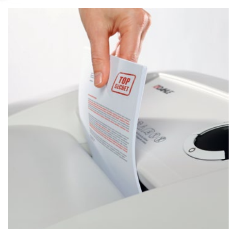
Innovative MHP technology® shreds up to 30 % more paper