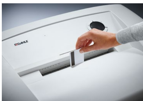
Dahle Office 414 document shredder