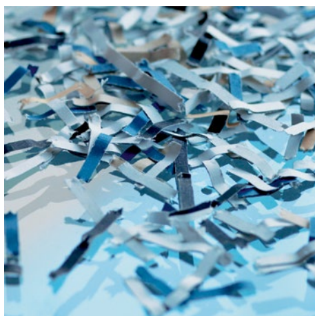
P-4 security: recommended, for example, for data media containing particularly sensitive, confidential and personal data