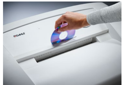
Dahle Security 514air document shredder