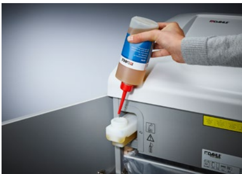
Dahle Security 514air document shredder