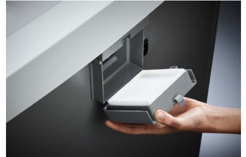
Dahle Security 514air document shredder