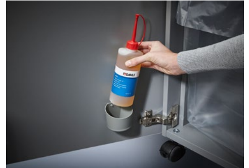
Dahle Security 514air document shredder