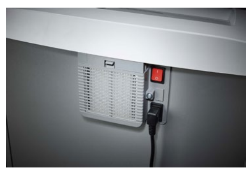
Dahle Security 514air document shredder