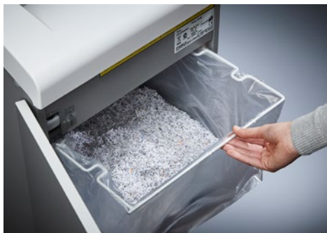
Dahle Security 514air document shredder