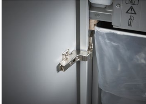
Dahle Security 514air document shredder