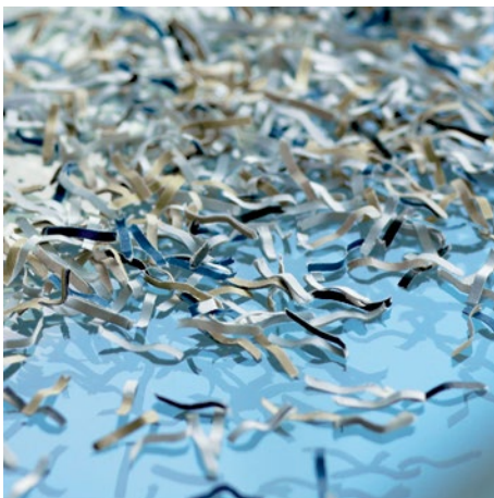
P-5 security: recommended, for example, for data media containing secret data