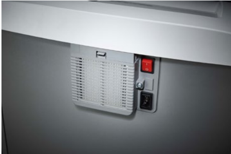
Dahle Security 514air document shredder