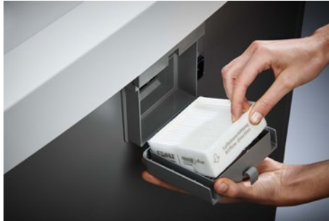
Dahle Security 514air document shredder