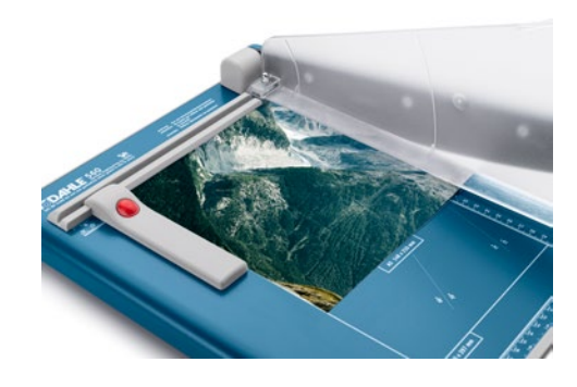
Dahle 560 guillotine - compact entry-level guillotine for hobby use