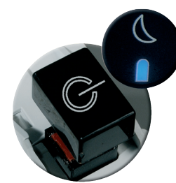
AUTOMATIC DISCONNECTION FROM THE MAINS

heavy duty chain drive system and metal gears