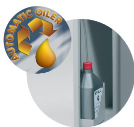
AUTOMATIC OILER - AO

Just touch the controls to activate the machine functions. Keep your finger on the "Forward" control for 5 seconds and the machine functions continuously for 30 seconds when transparent material needs to be shredded. A light comes on when the blades need to be oiled