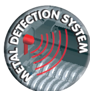
METAL DETECTOR - MD

Stops the machine when large metal objects, which could cause a damage to the cutting knives, are accidentally inserted.