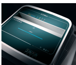
TOUCH SCREEN PANEL

Just touch the controls to activate the machine functions. Keep your finger on the "Forward" control for 5 seconds and the machine functions continuously for 30 seconds when transparent material needs to be shredded. A light comes on when the blades need to be oiled