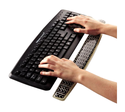
Ergonomic wrist position

Provides support to your wrists, ensuring your forearms are horizontal and wrists are in a neutral position.