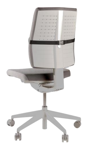
Easy to Attach Adjustable strap with durable buckle holds lumbar cushion in place.