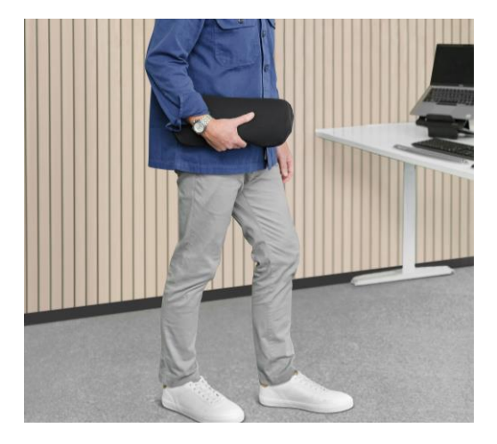
Lightweight Compact design for easy transportation wherever you work.

Fabric cover made from 100% post-consumer recycled polyester fabric. Foam contains post-consumer recycled content from mattresses.