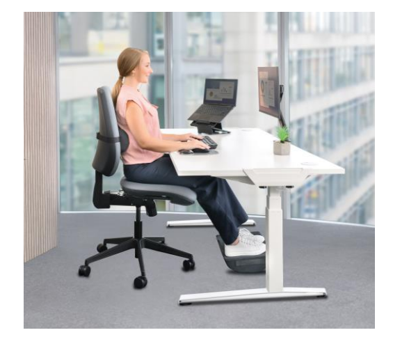
Ergonomic Design Lumbar support to prevent back tension.