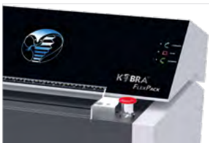
REMARKABLE TOUCH SCREEN PANEL