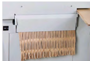
ADJUSTABLE CUSHIONING VOLUME OF HARD CARTON