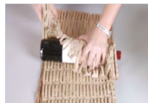
FILLING MATERIAL FROM CORRUGATED CARDBOARD for safe deliveries of any product.